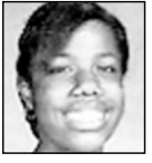
CHOWAN BRIGHTFUL LINGANORE SENIOR JUMPER

■ County champion in high jump and 100 hurdles. Second in the 4A high jump and fourth in 4A hurdles.